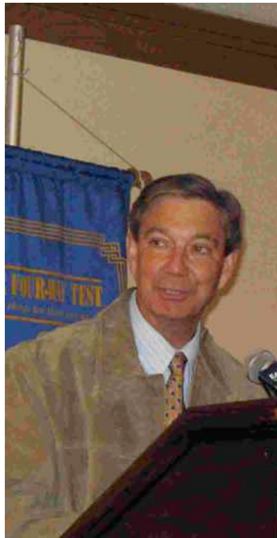
Premier Pat Binns speaking about his government's commitment to improving literacy in PEI.