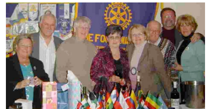
The 1st place winners of the special Trivia Night event. More than 60 members and guests attended the dinner meeting.