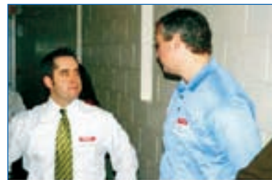
"Common People... UNCommon Purpose"