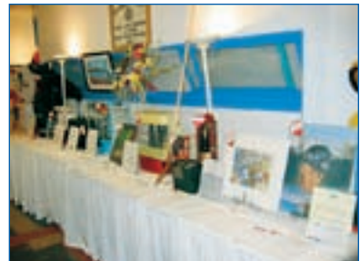
"Common People... UNCommon Purpose"